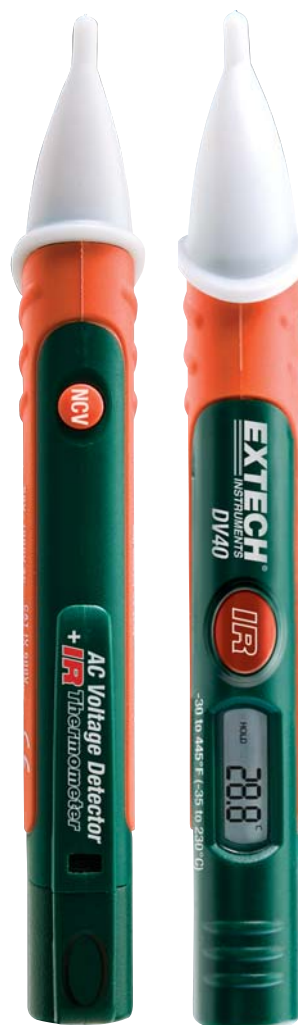
Non-Contact AC Voltage Detector