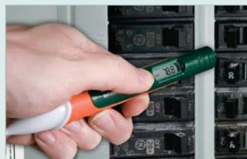
Built-in IR Thermometer with LCD displays non-contact temperature measurements