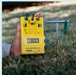
Check resistance between earth and grounding rod.