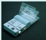
Adjustable "Flip-up" display