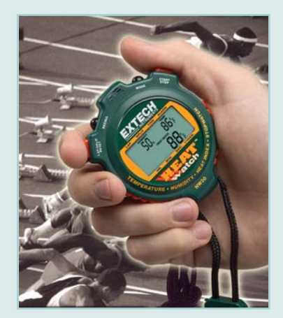
Ideal for use in sporting events. HW30 HeatWatch is recommended by the National Health & Wellness Club